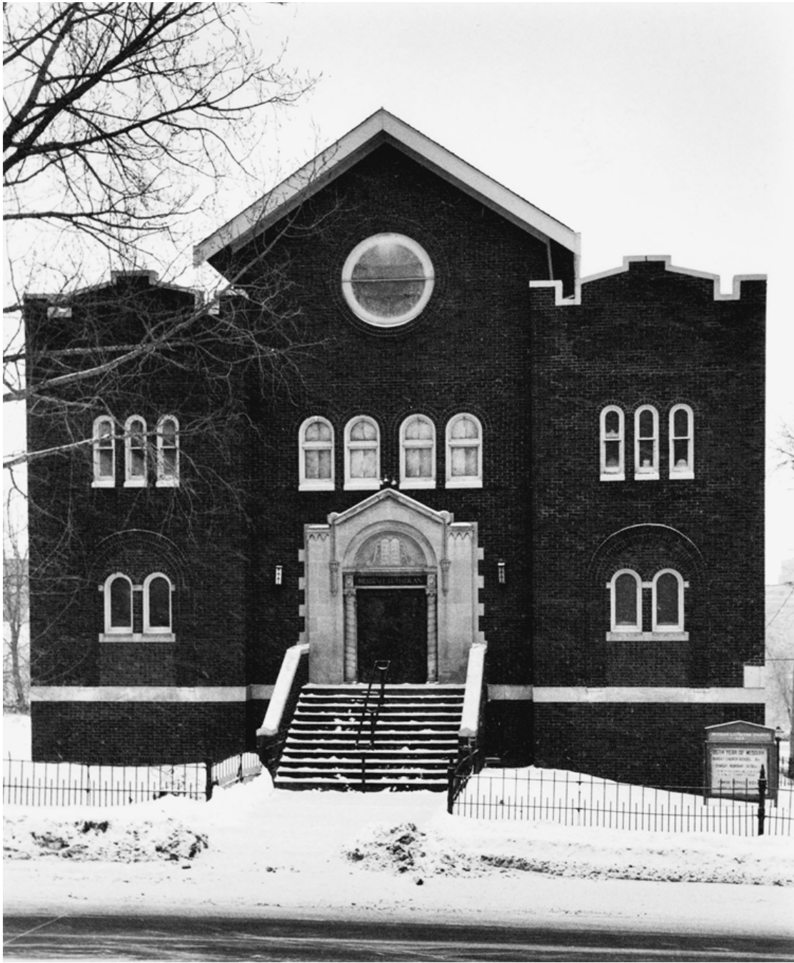
Tifereth Israel Synagogue, date and photographer unknown

302 East 4th Street | Architect: Unknown | Built: 1922 | Lost: ca. 1995